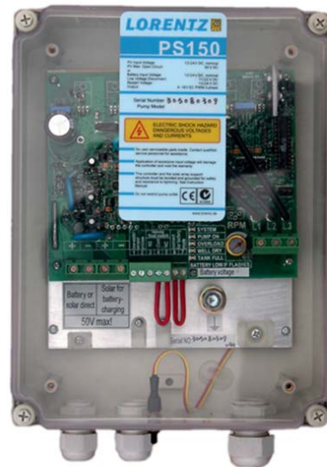
PS150-Centric C-SJ5-8 Controller, Pump and brushless motor

2 year against defects in materials and workmanship