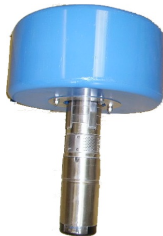
PS150-Centric C-SJ5-8 with float